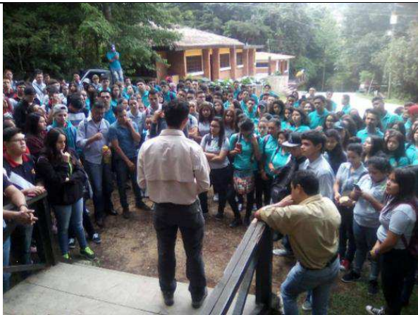
Environment education with high school students