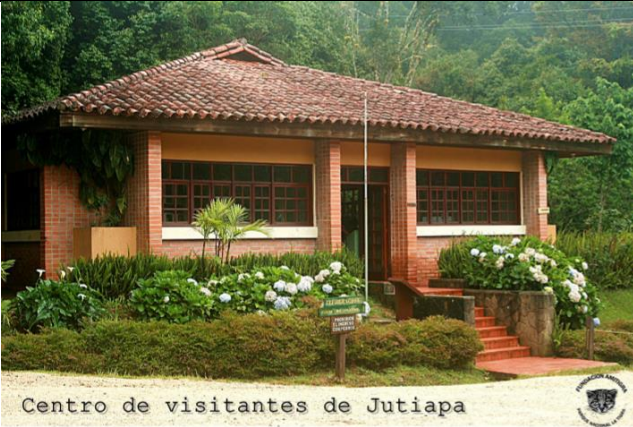
Centro de visitantes de Jutiapa