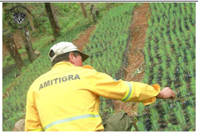
Tree nursery to reforest different areas surrounding Tegucigalpa