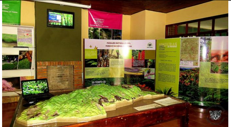
Mockup /maquette of La Tigra with information of all the rich flora and fauna living in the mountains