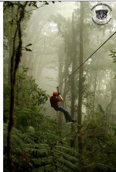
Besides trekking and camping, AMITIGRA offers other activities such as canopy in order to experience the whole park